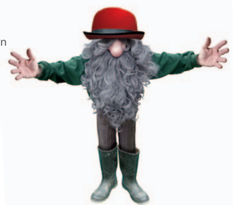
The Little Man